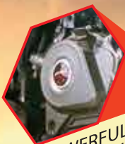
POWERFUL 160cc DTSI ENGINE