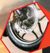
FRONT DISC BRAKE